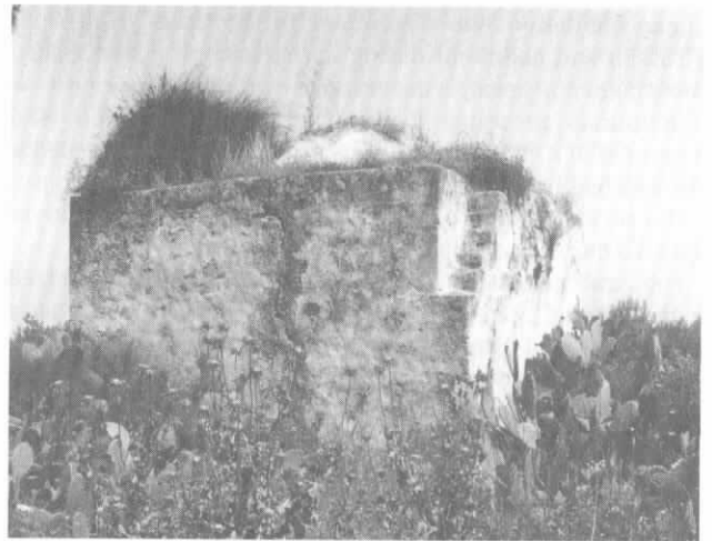
The shrine of Shaykh Shahada. (May 1987) [AYN GHAZAL]

importance during the war of 1948. In the late nineteenth century, 'Ayn Ghazal was a small village built of stone and mud. The village's 450 residents cultivated 35 faddans (1 faddan = 100–250 dunums; see Glossary). [SWP (1881) II:41] The villagers were Muslims and maintained a shrine for a local sage named Shaykh Shahada. The village had an elementary school for boys that was founded around 1886, during the Ottoman period. It also had an elementary school for girls and a cultural and athletic club. Water from a nearby well, drilled in the 1940s, was pumped into the village via a pipeline. The village economy was based on livestock breeding and agriculture; in 1944/45 olive trees were planted on about 1,400 dunums, and a total of 8,472 dunums was allocated to cereals. The village's proximity to the city of Haifa made it possible for part of the population to work in the service sector of the port and in its commercial section.