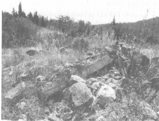
Rubble on the village site. (May 1987) [AYN GHAZAL]