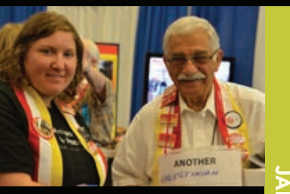
Methodists Divest: Pension board declares five Israeli banks off limits for investment.

Our work has grown so much we can't report in depth on everything you're helping make happen in each newsletter. Here are some highlights we wanted to make sure you knew about: