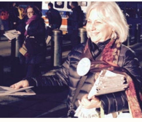
JVP-NYC and Jews Say No hand out 10,000 copies of a parody 'New York Times supplement' throughout the City.

Going undercover to distribute 10,000 copies throughout